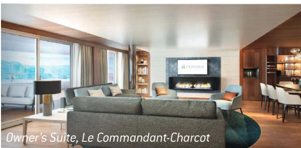
Owner's Suite, Le Commandant-Charcot